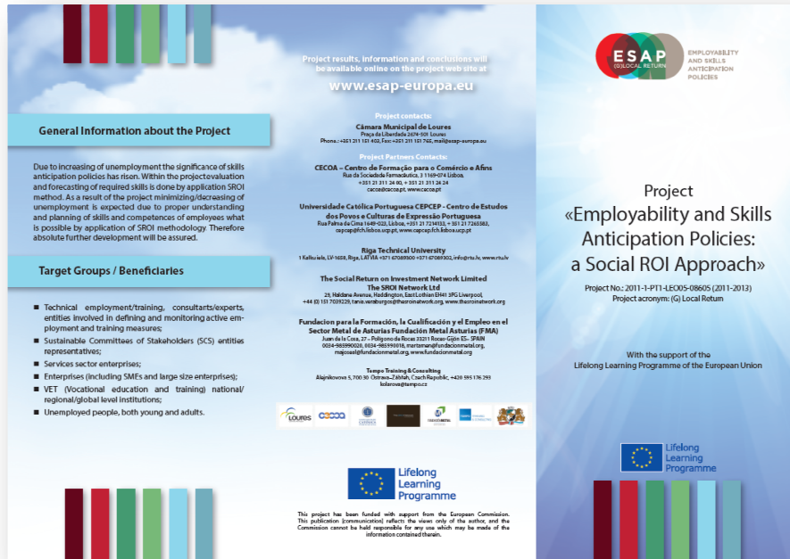
Fig. Project's booklet

Riga Technical University in collaboration with other project partners created a project brochure (in paper format). The brochure is available in the five partner-countries languages: Czech, English, Latvian, Spanish and Portuguese.