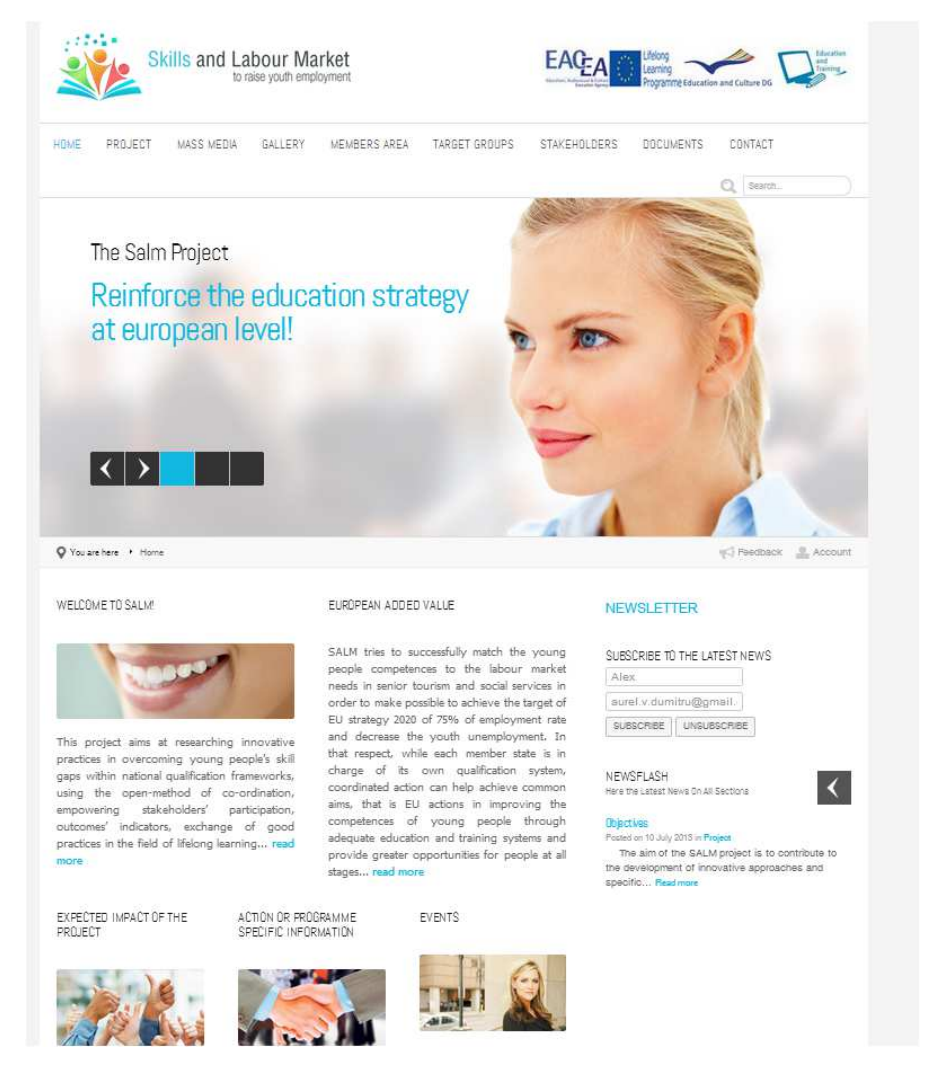
screenshot of homepage